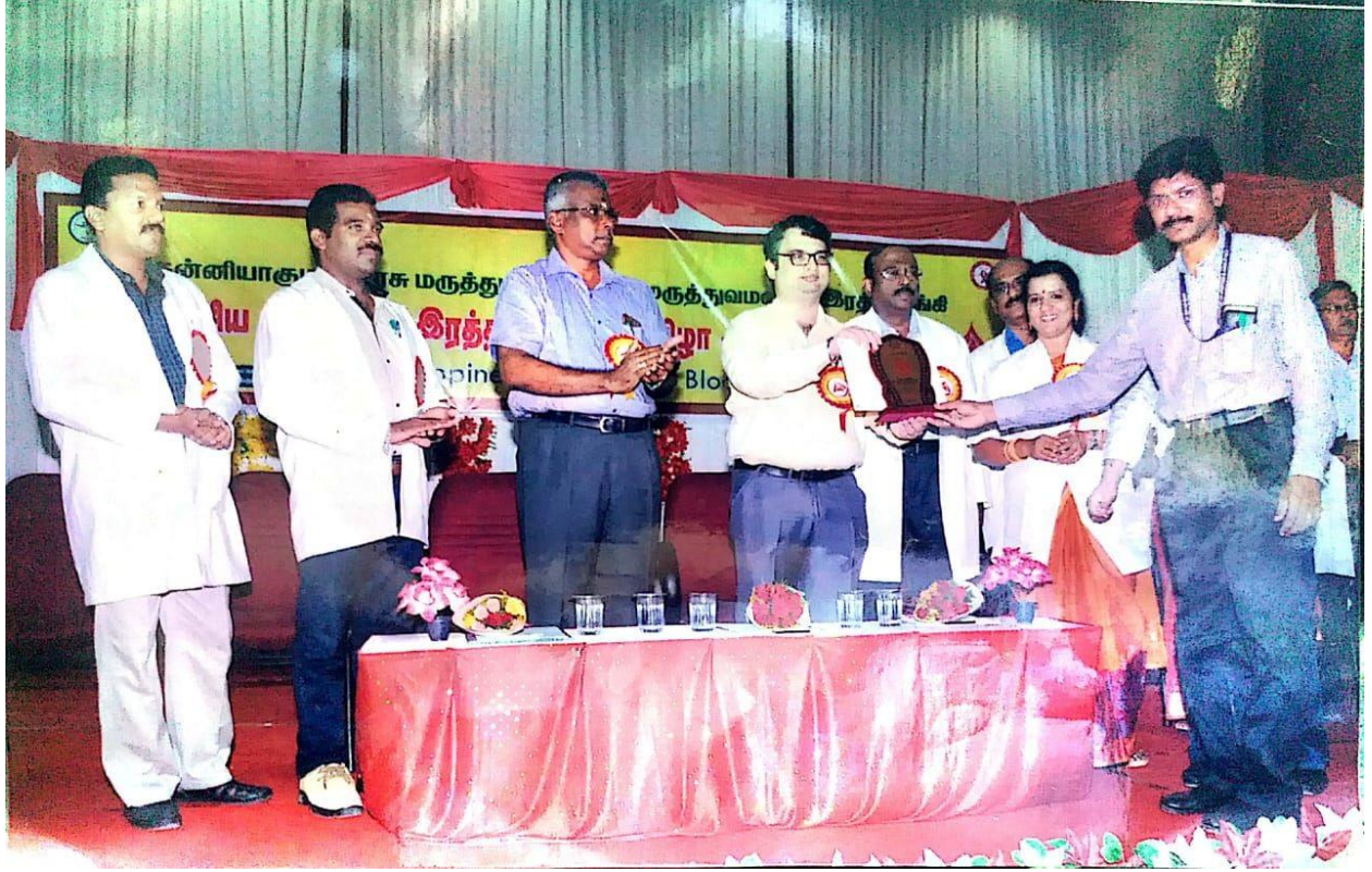
Appreciation for volunteer blood donation