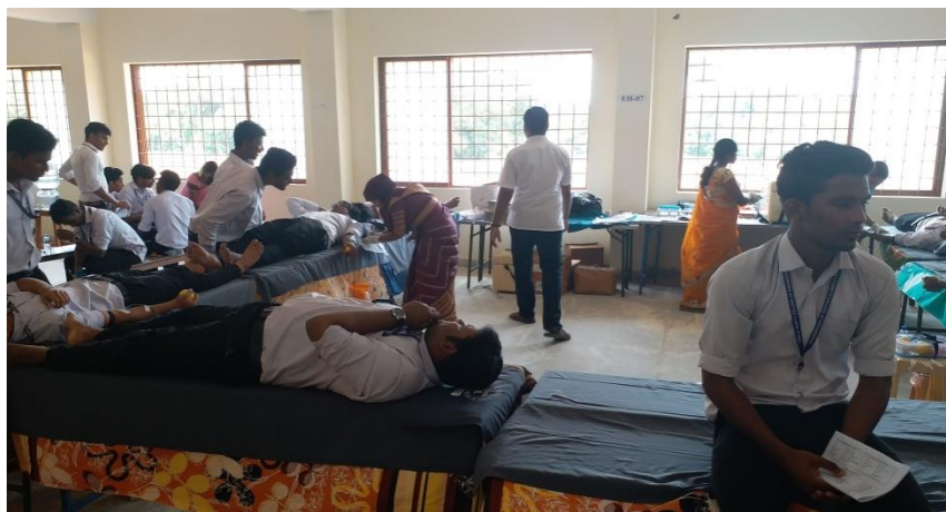
Students Participated in Blood Donation Camp

Deworming day conducted at Stella Mary's College of Engineering on 10/8/2016