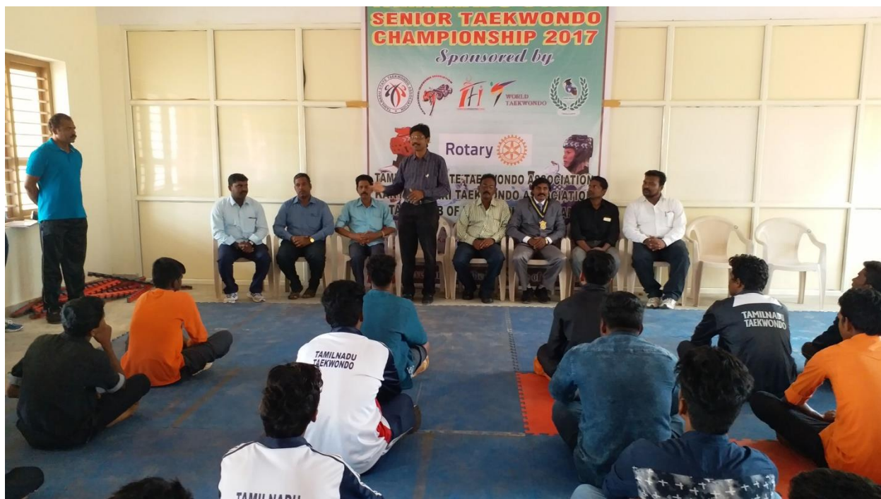
Tamil Nadu State Senior Takewonda championship 2017 was conducted on 5/11/2017