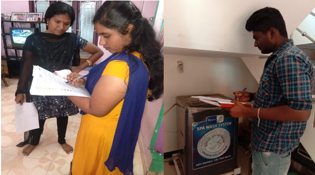
Energy Audit near residential area