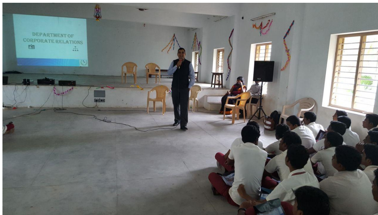
Career Guidance Program to school Students out side our college

Dengue Awareness program organised on 12 th October 2018 with NSS and YRC